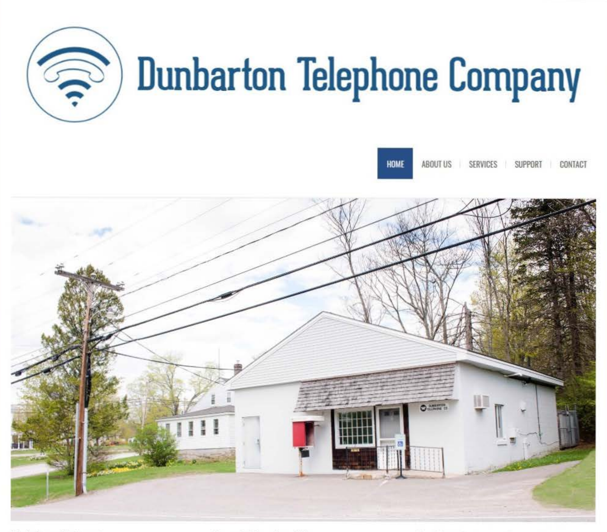
EXHIBIT "A" www.dunbartontelephone.com