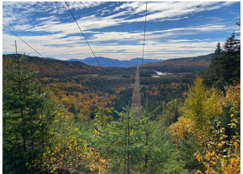
Highest point (2,606 ft) at crossing of Appalachian Trail is 4+ miles from closest road in either direction

The photographs Eversource provided in its October presentation to the PAC, purporting to show degradation since 2022 do not meet any standard of evidence: