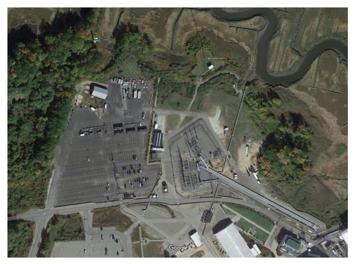
Figure 1: Current Configuration of Area at Seabrook<sup>4</sup>